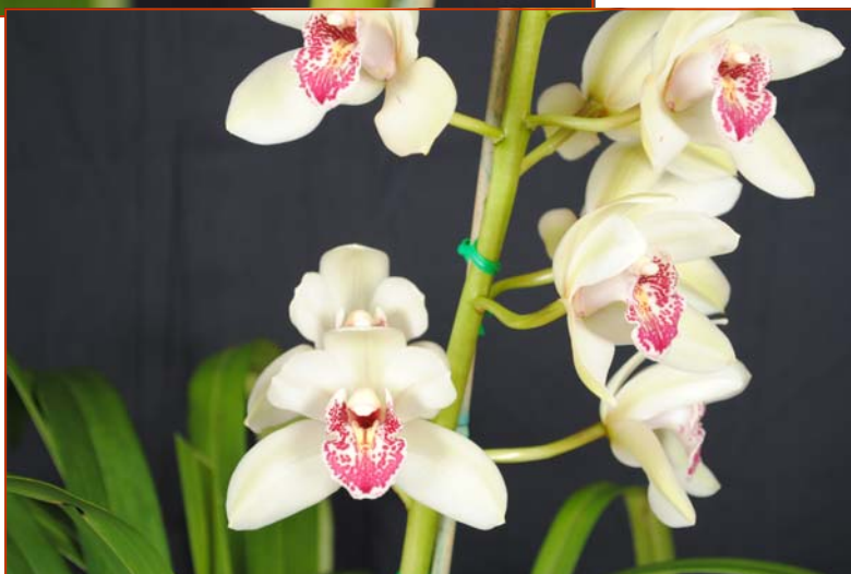
Miniature Hybrid First Shown Regal Fire (Dolly X Bewitched) Grown by Pauline Hockey